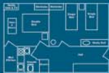
Typical Family Apartment

There are a number of accommodation options that you can tailor to your own requirements depending on the size of your group. You can choose from a double room with tea making facilities, a double or twin with mini-kitchen or a two-room family apartment with mini-kitchen which sleeps up to four adults. Several ground-floor apartments are also available.