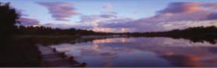
Sunset On Lower Lough Erne | Co.Fermanagh

Belmore Court Motel www.motel.co.uk Enniskillen Northern Ireland