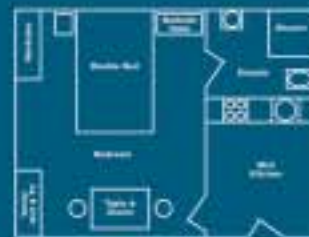
Typical Double Room

“ Absolutely great, the staff are fabulous ”