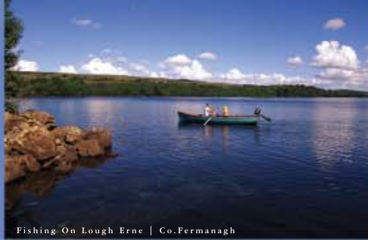
Fishing On Lough Erne | Co.Fermanagh

Fermanagh is an area rich heritage with its ruined castles, historic houses and famous island monastic site. Places of interest include stately homes of Castle Coole and Florencecourt, the breathtaking Marble Arch Caves or Belleek Pottery, where you can watch the skilled craftsmen at work.