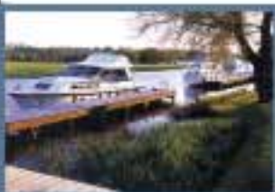
Broad Meadow Lough Erne

Tempo Road Enniskillen Co. Fermanagh Northern Ireland BT74 6HX