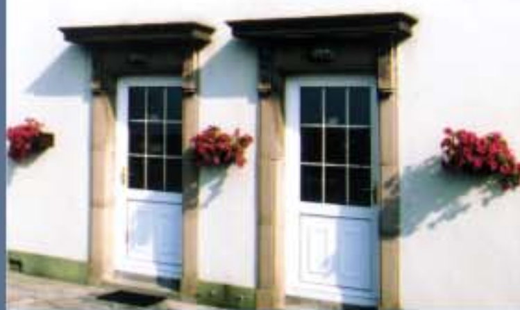
Welcoming Doorways of our Apartments

There is a high standard of care that is evident throughout all the accommodation; which is priced per room/night. For those not wishing to avail of the self-catering facilities, the surrounding area boasts an abundance of good restaurants, catering for a wide variety of tastes.